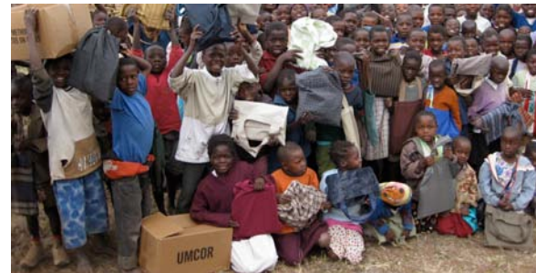
Children in Zimbabwe with their new school kits.

So, when more than 400 children in rural Zimbabwe received school kits from UMCOR to help them prepare for the reopening of their schools there were shouts of joy. These humble satchels containing notebooks, scissors, and eraser, ruler, crayons, pencils and pencil sharpener are tangible gifts of love for children living in an area of the world where life is difficult as best.