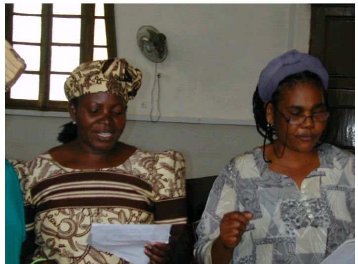
Two students practice teaching