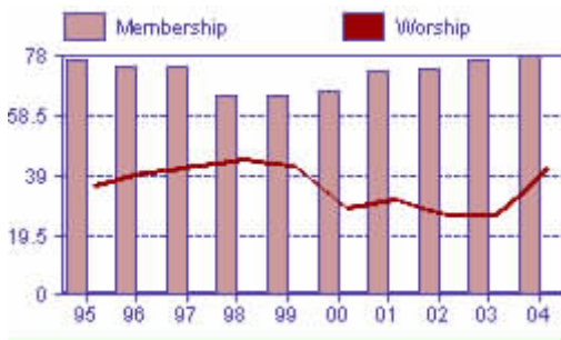
Membership and Worship Attendance